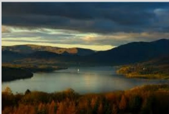
Lake Windermere above Carlisle Market Square below

Cumbria: Was formed—or rather reformed— during the re-organization of English counties in 1974, its roots go back to early Medieval England when the region, which was known as Cumbria at that time was part of the British Kingdom of Strathclyde. A predominately rural county now with an emphasis on tourism and agriculture Cumbria was in the past one of the most significant political and economic hubs of England. Hadrian’s Wall runs across the north of the county, during the later Medieval periods when Scotland and England were in a state of near-permanent conflict the royal castle of Carlisle anchored the northwest frontier. During the American Revolution John Paul Jones even briefly attacked the Port of Whitehaven! Many of the early developments of the industrial revolution took place in West Cumbria and of course the region was one of the most important parts of the Romantic period with the flourishing of the Lake District Poets. The Lake District National Park helps to preserve the nature and character of the region now. The county is, as a whole, undergoing something of an economic and cultural revival perhaps best characterized by the formation of the new University of Cumbria in 2007.