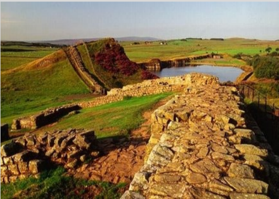
Hadrian's Wall will be visited as part of Field Trip 2 (FT2)