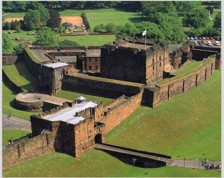
Carlisle Castle (top)