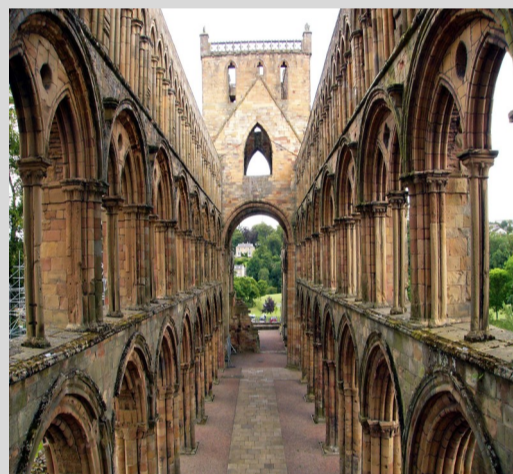
Jedburgh Abbey from FT 3

Events and schedules are subject to change based upon local conditions, student interests, etc.